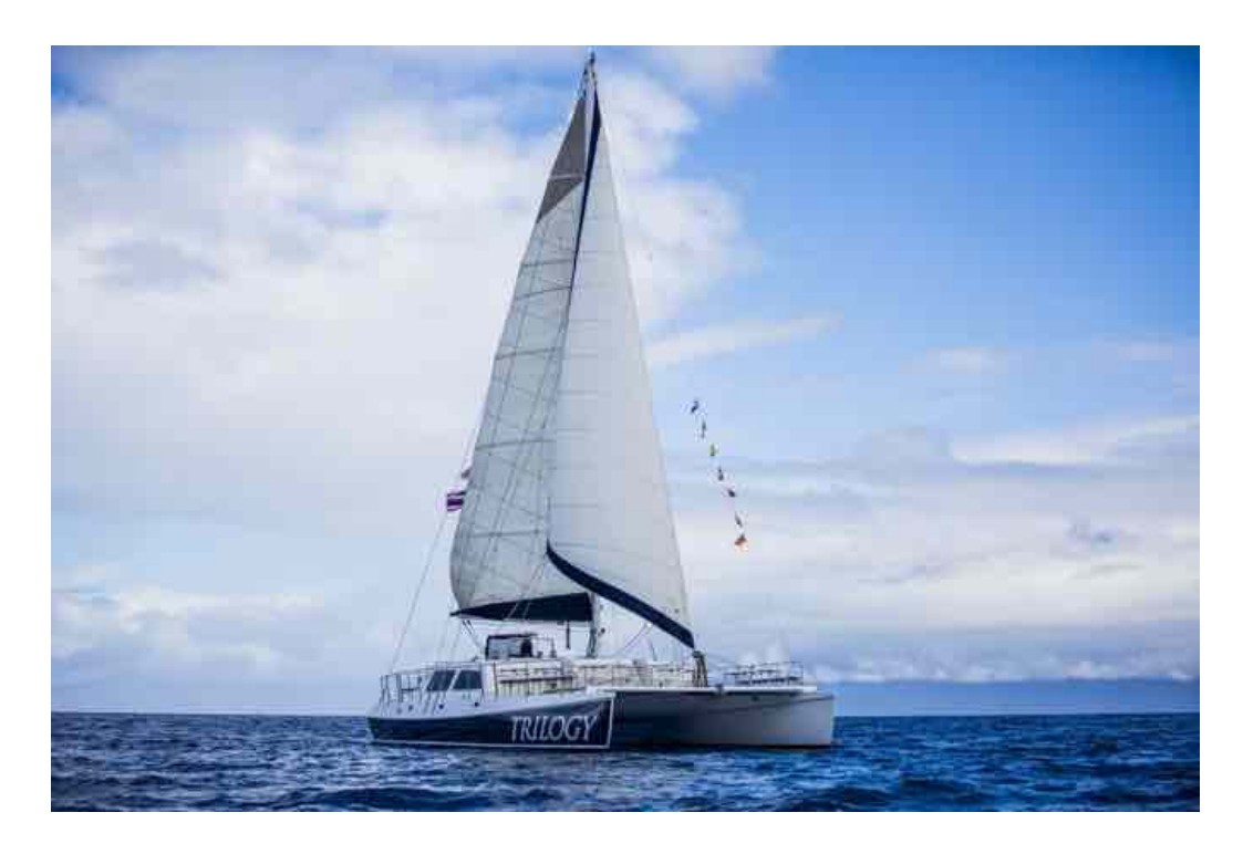
Depending on the size of your group, take one exclusive vessel for up to 54 passengers or two, with the second vessel's capacity set at 45 guests. This provides for a total participant count of up to 99 snorkelers per day.